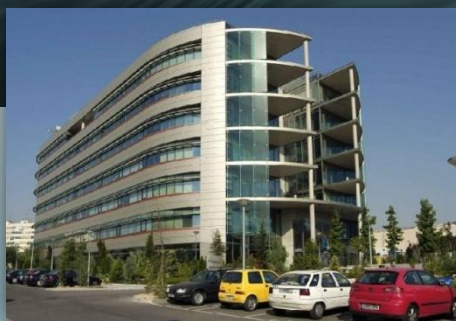
Alvento - Metrovacesa Business Park (Madrid)