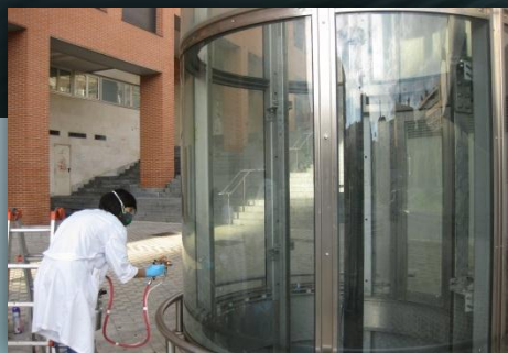
Abejeras Lift of Pamplona (Pamplona)