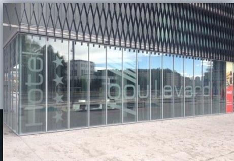
Boulevard Vitoria Hotel (Vitoria-Gasteiz)